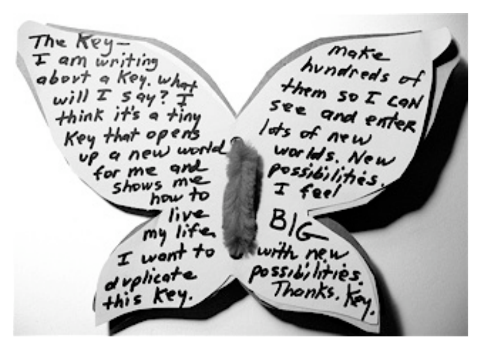
Sample Butterfly Booklet

The free-flow writing technique can be used at any time, on any topic. All the girls need to do is choose a situation or problem that they would like more information on so they'll know how to handle it, then write on that topic for 10 minutes without stopping to edit or to judge the content.